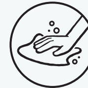
Correct hygiene practices

Please sign the register form (underneath this coversheet).